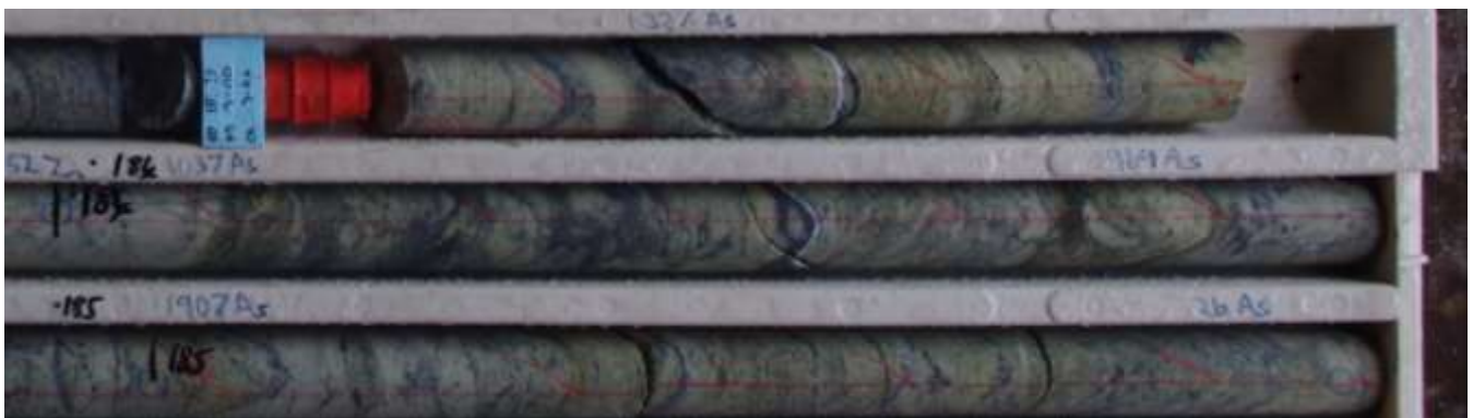
Figure 1. Typical style of sulphide mineralisation (darker zones and veins) in Hole CMIPT049 at about 184 metres down hole.

The mineralisation comprises multiple narrow stockwork-style veins and veinlets together with disseminated sulphides in the rock surrounding the veins (Figure 1). Readings with a portable XRF instrument on both holes (CMIPT048 and CMIPT049) indicate silver mineralisation of more than 100 g/t occurs in many places both in the veins and the surrounding rock. Although the mineralisation is visually similar to that encountered in previous drill holes, silver minerals were not observed (see announcements dated 31st August , 2nd September and 13th September 2016 ).