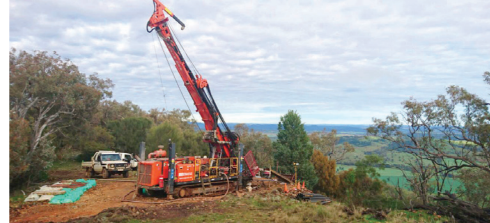
Drilling at Commonwealth

"Anyone looking from the outside might think we're lucky, but we've been making our own luck in all of this by staying active during the